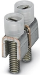
Fixed bridge, pitch: 10 mm, number of positions: 2, color: silver

Please be informed that the data shown in this PDF Document is generated from our Online Catalog. Please find the complete data in the user's documentation. Our General Terms of Use for Downloads are valid ( http://phoenixcontact.com/download )